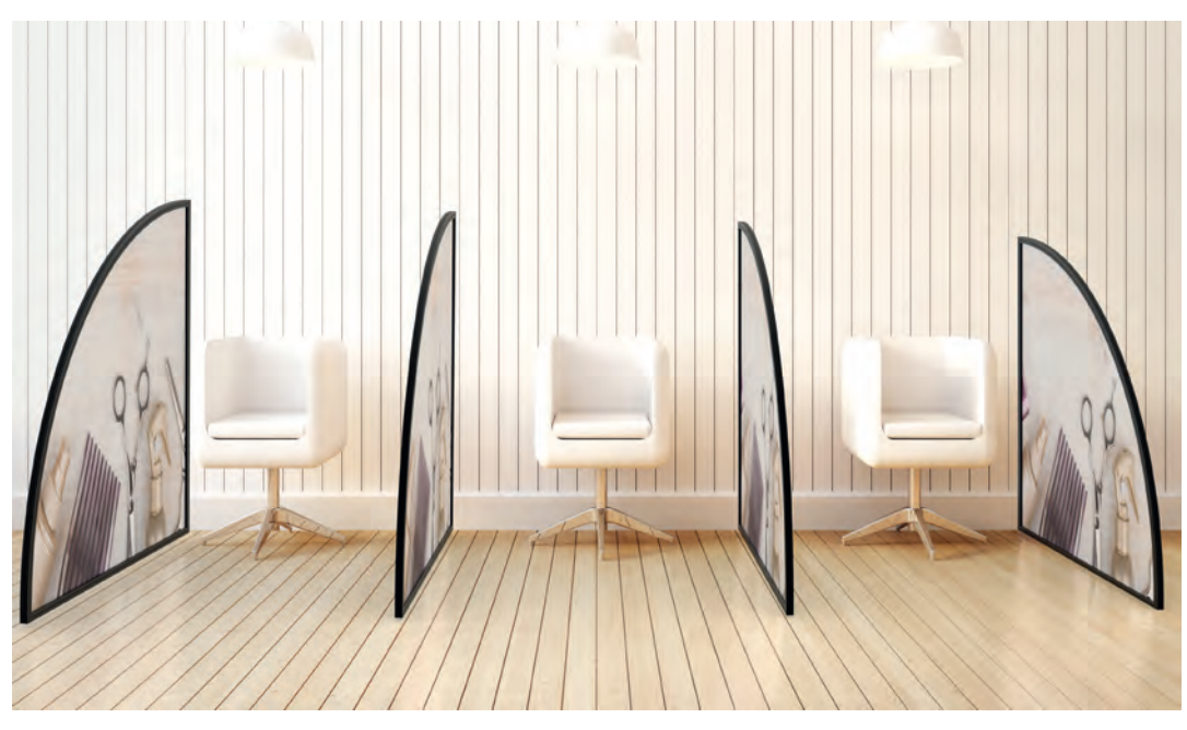
Separate waiting zones