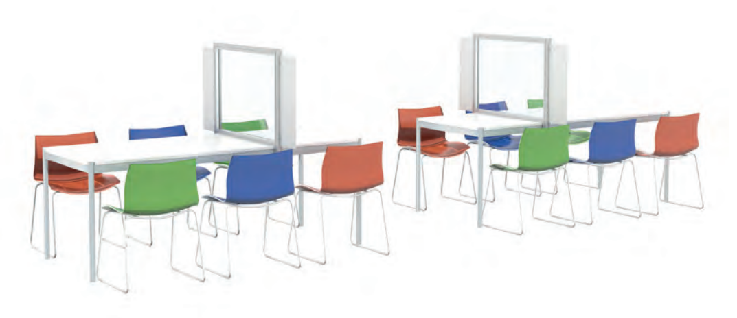
Protection that helps to maintain a direct exchange.