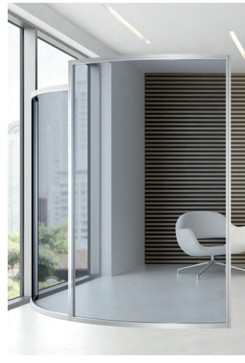
Perfectly integrated: curved forms