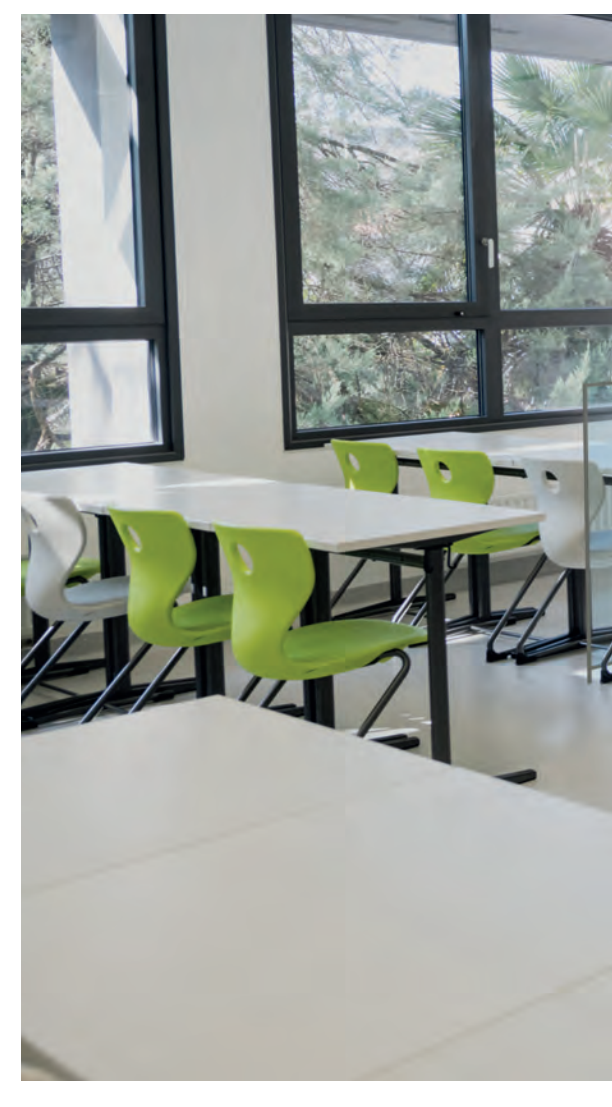
Safety for students in small spaces