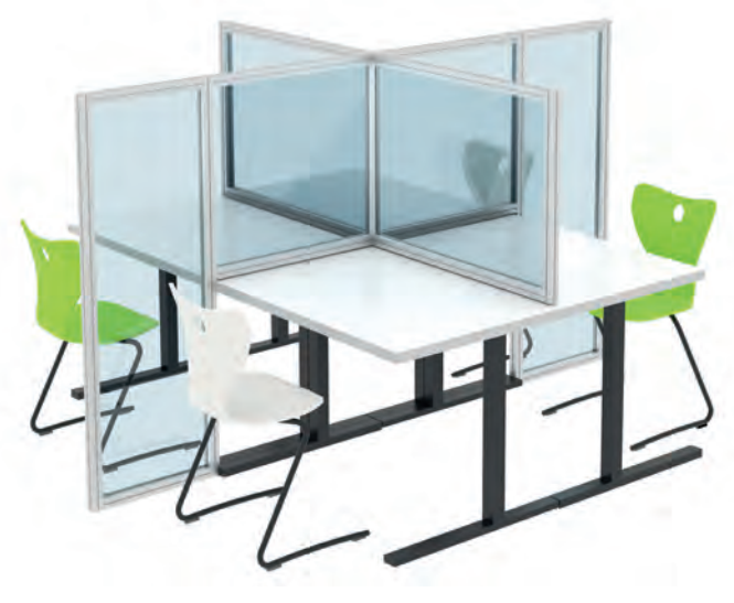
Solution for teamwork