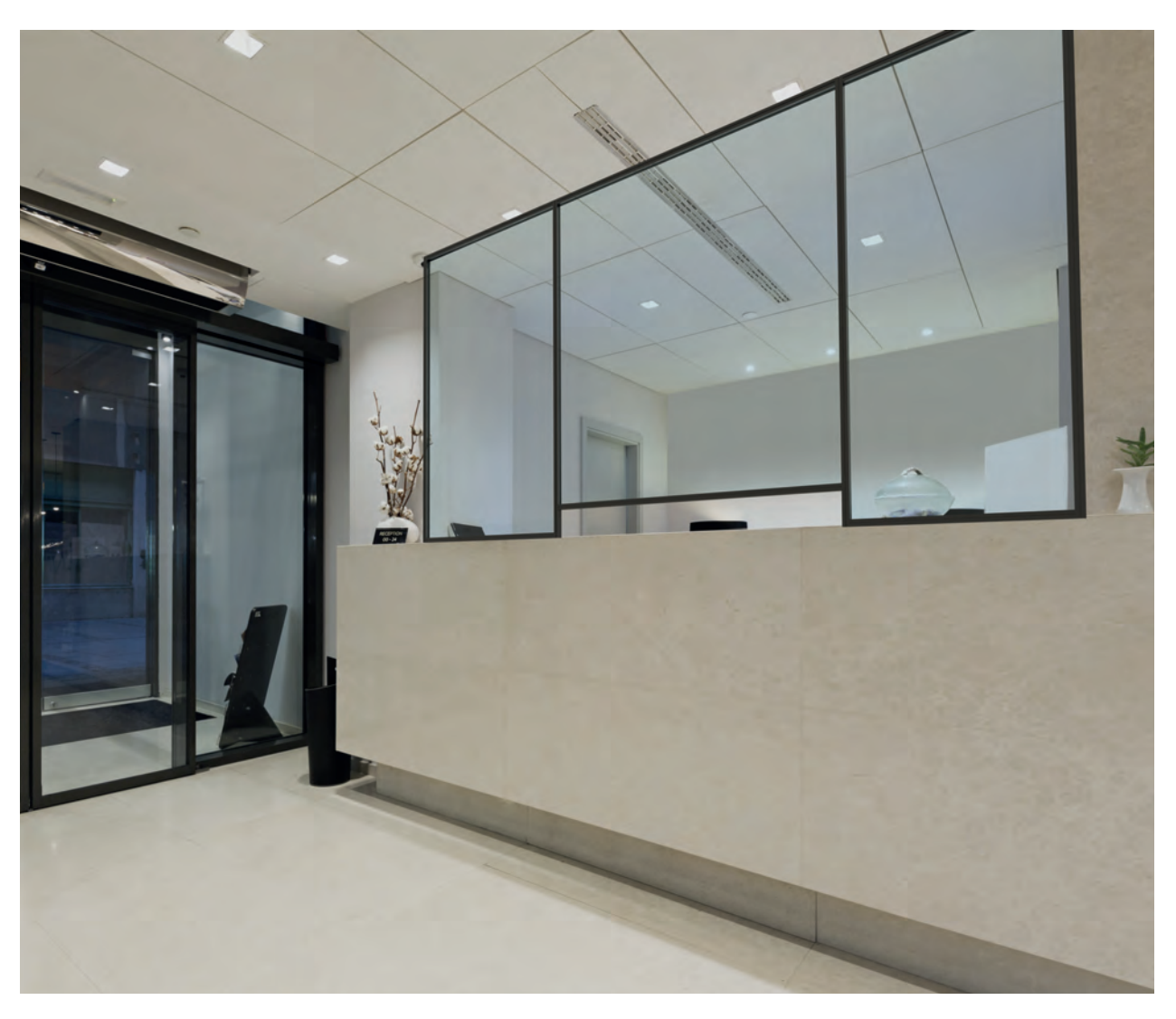
Hygiene protection with opening