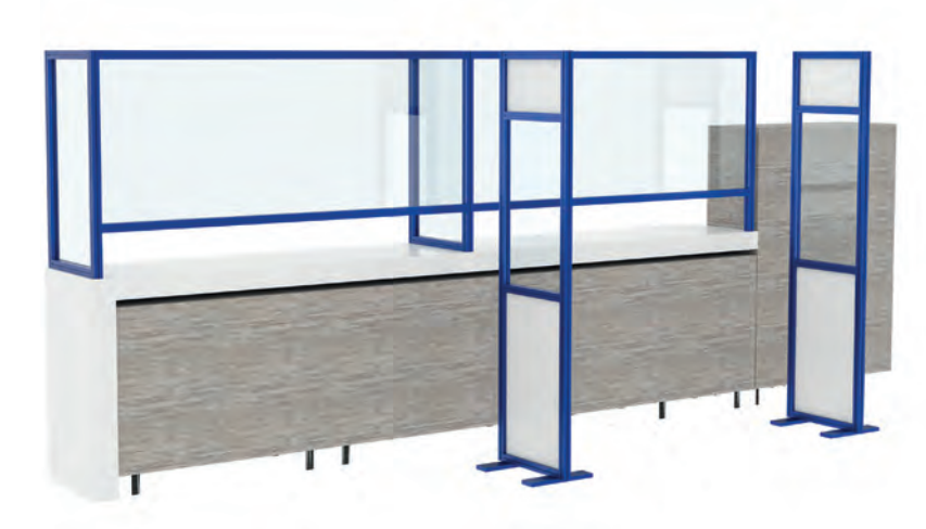
The modules can be extended as required.

Our systems are available at short notice in large quantities.