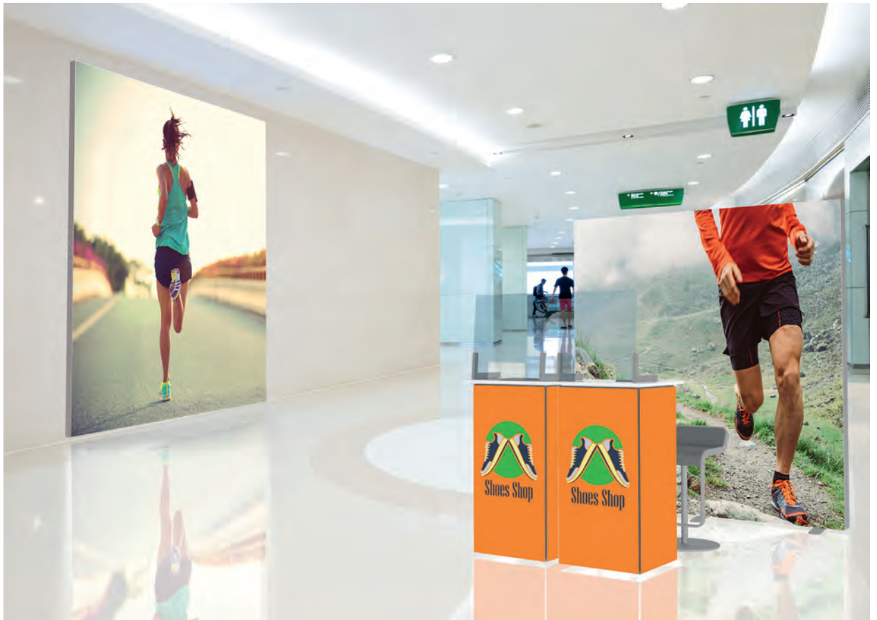
Ideal for small pop-up stands