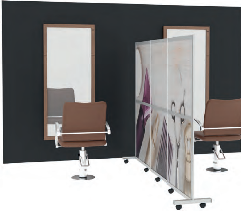
The folding wall elements can be folded out as necessary.