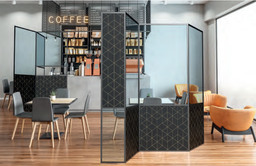
Colours to match the design: coated aluminium extrusions.