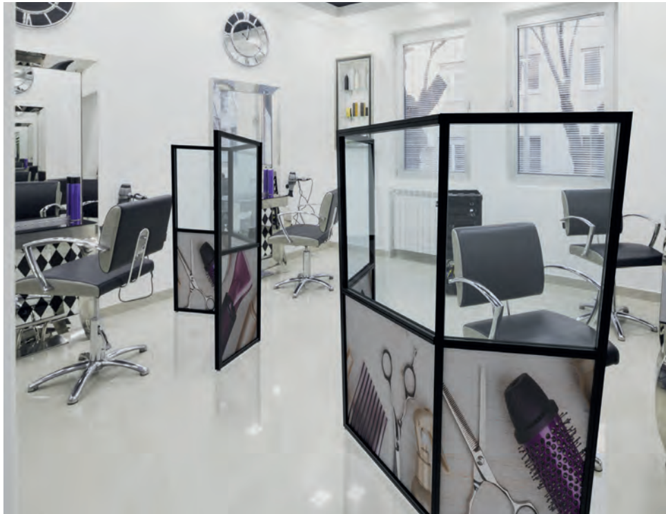
Everything in view despite protected work areas.